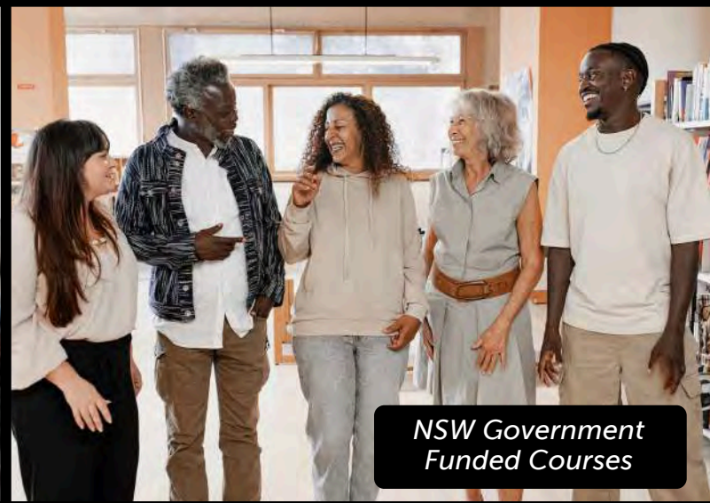
NSW Government Funded Courses