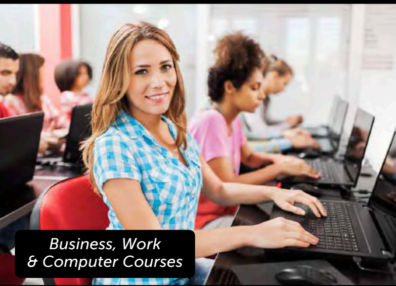
Business, Work & Computer Courses

The Parramatta College Inc t/a Parramatta Community College RTO 90276