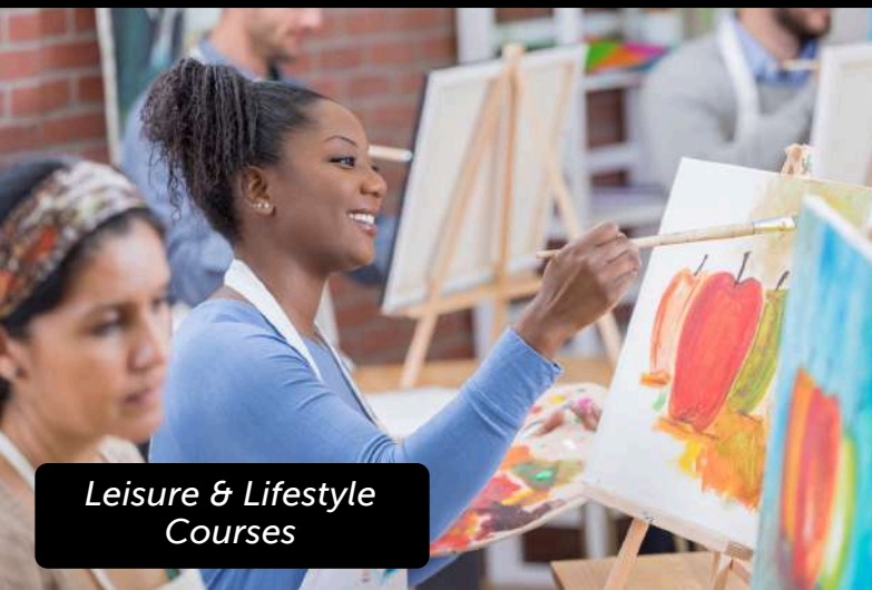
Leisure & Lifestyle Courses